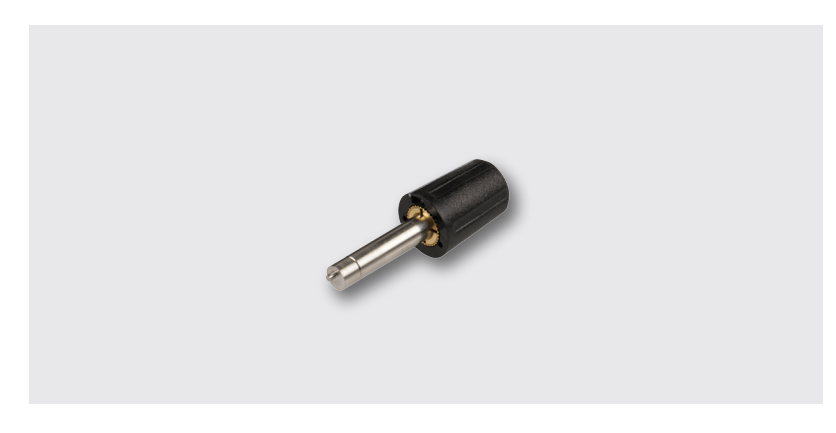
Figure 13: Eccentric key type 60EX-4 or type 60EX-5.