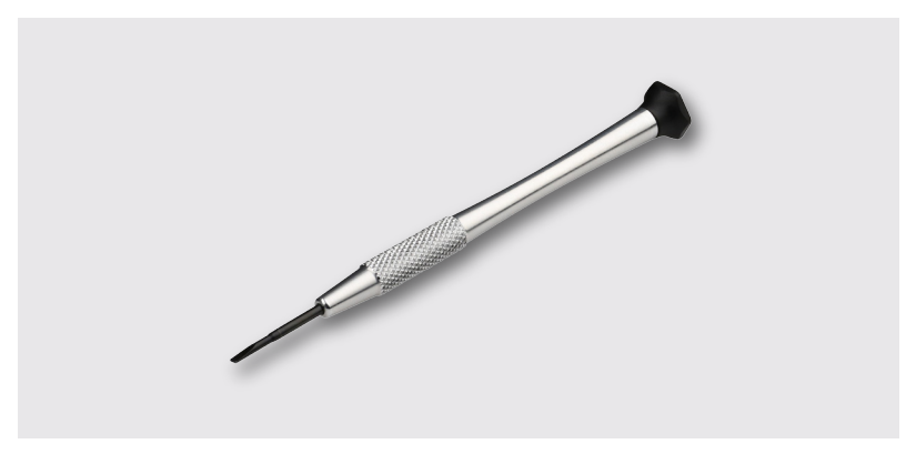
Figure 12: Screw driver type 9D-12 and eccentric key type 60EX-4 or type 60EX-5.

For adjusting the fiber collimators series 60FC-K you need the following tools: