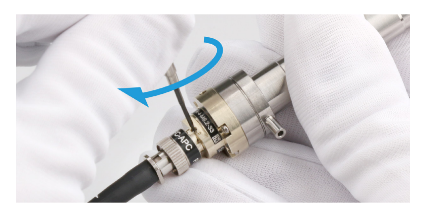
Figure 8: Finally, gently tighten the fiber grub screw to reduce the free play of the ferrule in the receptacle.

The free play in between the connector ferrule and receptacle is only a few microns, but necessary for inserting the ferrule without force.